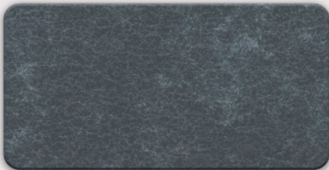
TX Velvet Grey