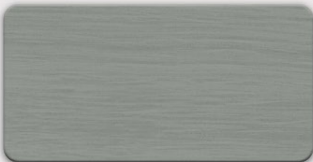
TX Velvet Zinc