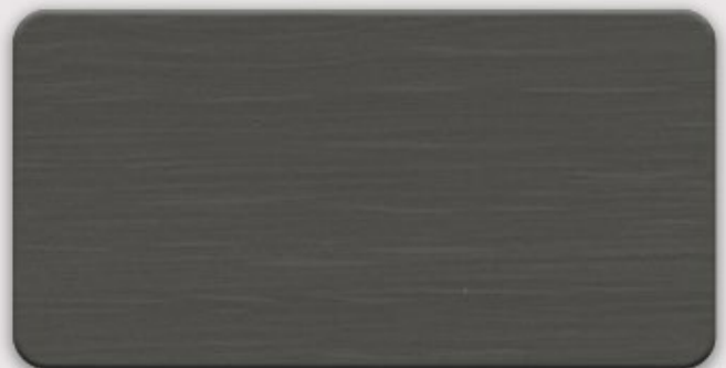
TX Velvet Basalt