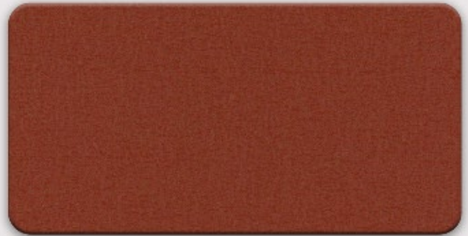
TX Ceramic Red